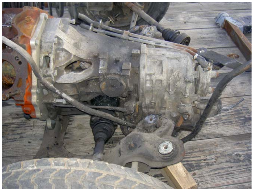
Need to remove steering linkage and axels