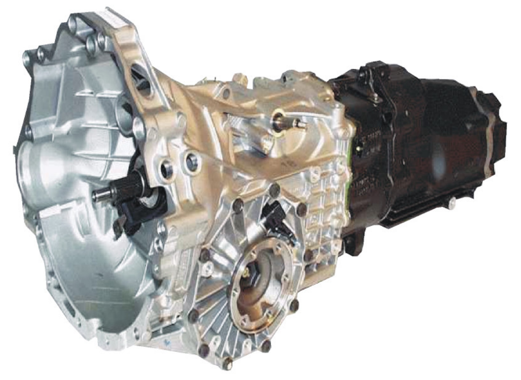
Audi 01E transaxle - 5 or 6 speed