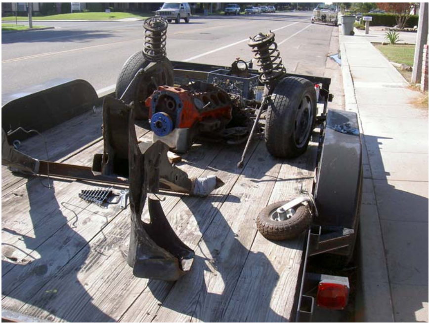
Pulling the frame from the cradle assembly