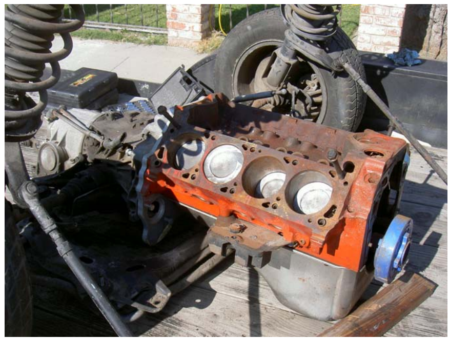
Block will be used for alignment purposes