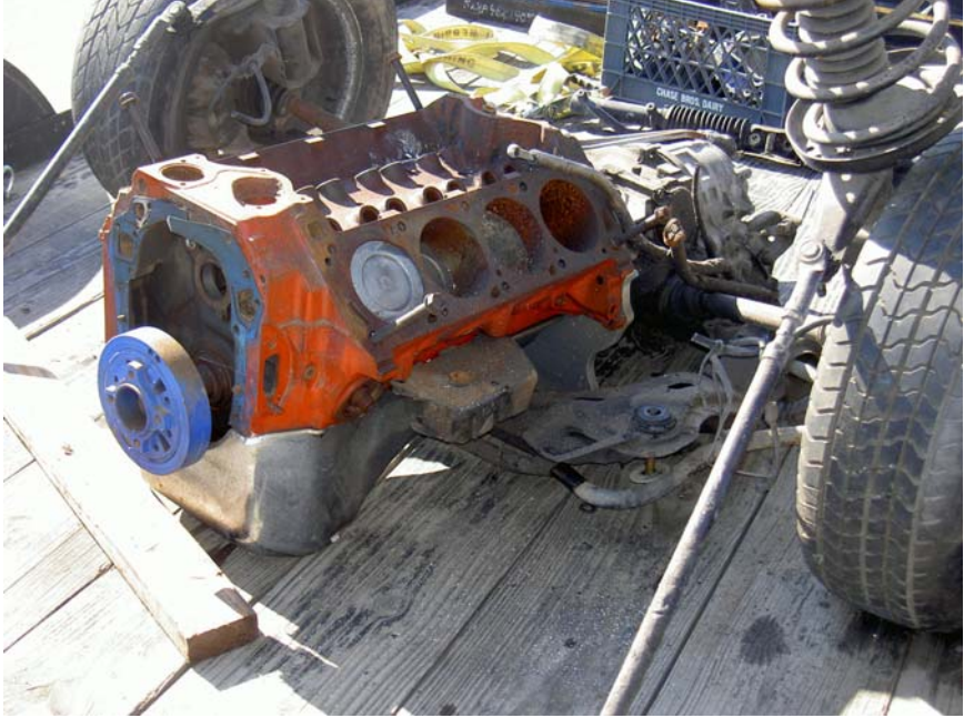
Dummy 351C block for measuring of motor mounts and transmission mounts