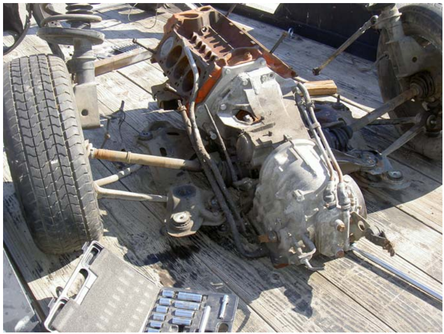
Stripping down to basic assemblies