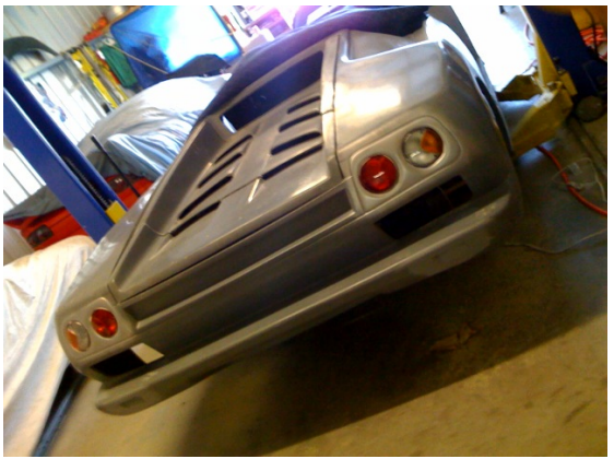
Diabolic with 2001 original taillights