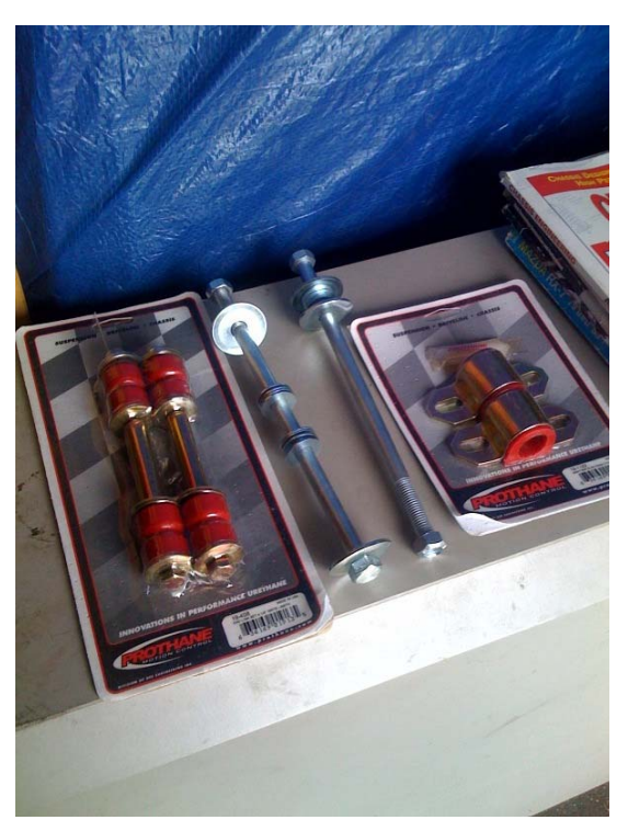
More parts arriving