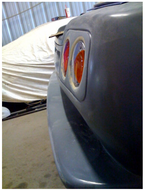
Side view of taillights mounted