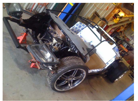
Modified Fiero chassis

Progression of taillights and suspension