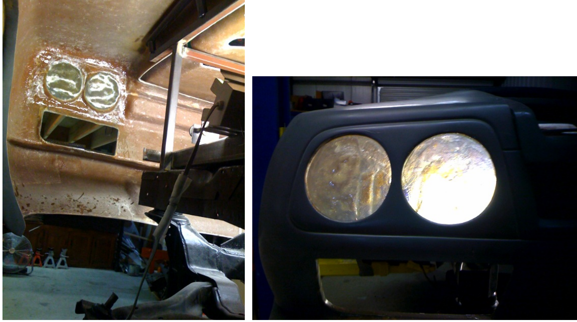
Fiberglass was molded over the openings to prepare for smaller holes required.