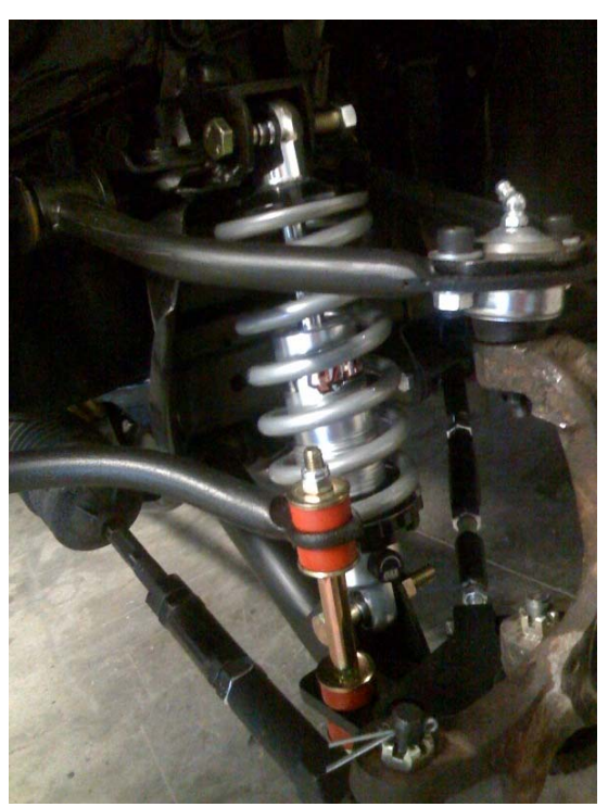
New suspension installed