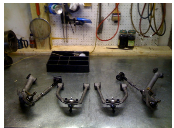
New suspension parts fabricated