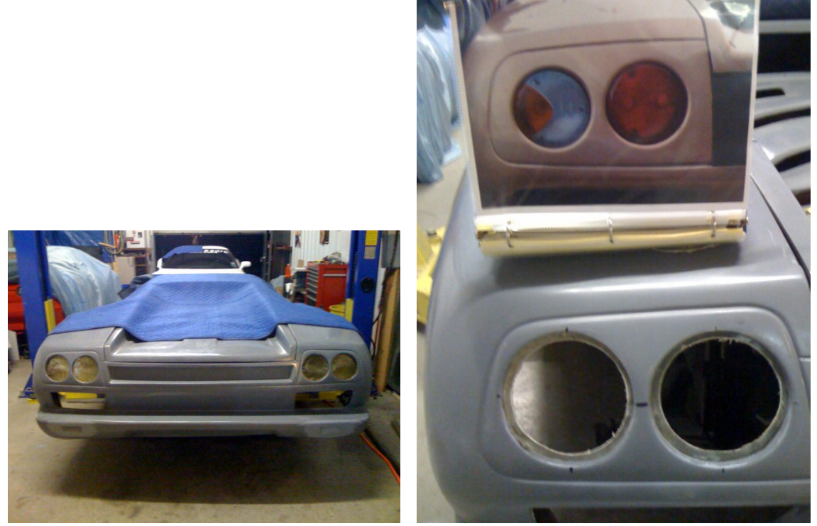
Holes cut in molded mounts as per picture Diabolic with molded in taillight holes